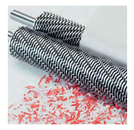
SOLID STEEL CUTTING SHAFTS Robust and durable: high-quality paper clip proof cutting shafts with lifetime guarantee under conditions of fair wear and tear.