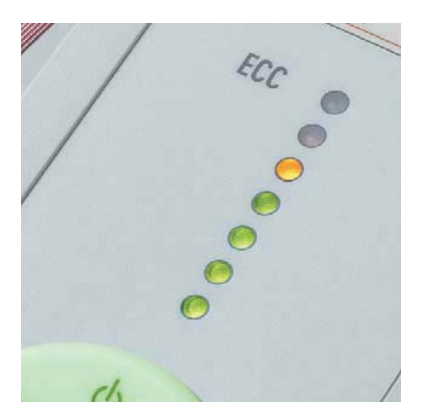
ECC – ELECTRONIC CAPACITY CONTROL This electronic feature indicates the used sheet capacity during shredding process to avoid paper jams.

Ease of operation: intelligent multifunction switch element with integrated optical signals indicating the operational status. Additional "emergency switch" function.